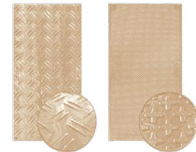
Use DuraDeck 2 & 3 for Vehicles/Pedestrians (DuraDeck 2 shown)