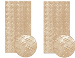
Use DuraDeck 1 & 4 for Vehicles (DuraDeck 1 shown)

DuraDeck 4: Rugged on one side, smooth on the other. Designed for use in loading areas or construction sites with heavy vehicle traffic on surfaces.